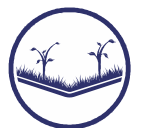
RESISTANT TO PLANT ROOT OVERGROWTH