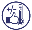
HIGH THERMAL STABILITY